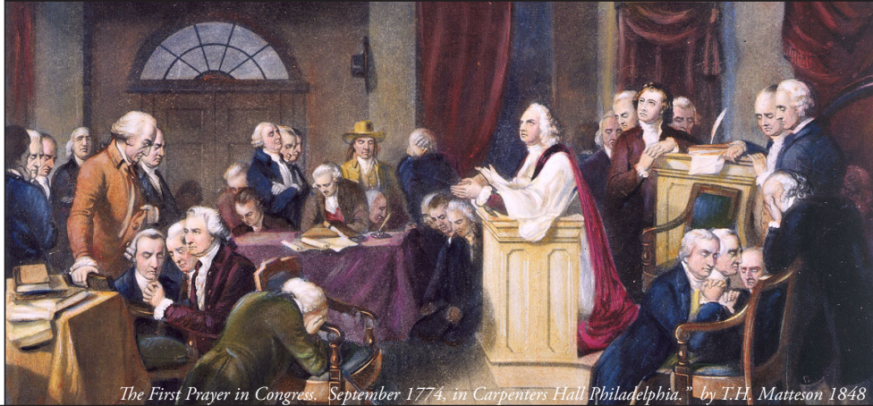
The First Prayer in Congress. September 1774, in Carpenters Hall, Philadelphia. by T.H. Matteson 1848